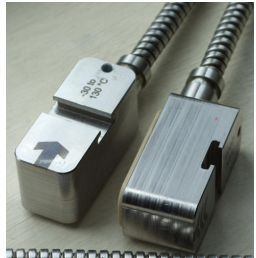
Ultrasonic flow sensors with stainless steel head casing and cable conduit for extreme robustness. There are two sensor types available to cover a diameter range from 10 mm to 3 m.

The KATflow series of ultrasonic clamp-on flowmeters can cover a pipe diameter range from 10 mm (0.4 inches) to 3 m (118 inches) with special solutions available for non-standard applications.