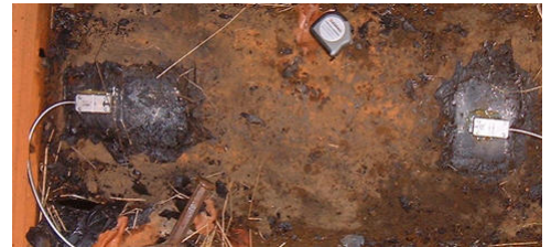
Ultrasonic flow sensors mounted on a main water line of Thames Water. After the installation the sensors were buried.

All of Katronic's ultrasonic clamp-on sensors have a minimum ingress protection rating of IP66. This means that they are suitable for installation on buried pipes, in open areas where they are subject to rain, and in plants where there is spray cleaning. There is also the option to upgrade the sensors to IP68 for permanent immersion in water.