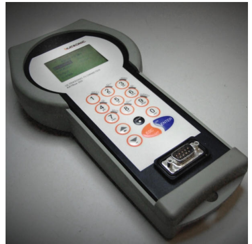
KATflow 200 hand-held flowmeter.

If additional accuracy is required, a process calibration can be carried out on site.