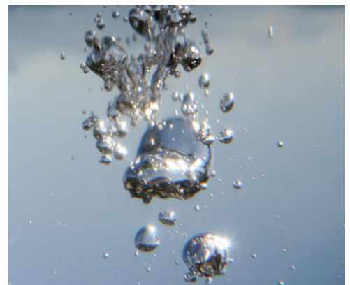
Katronic's flowmeters can cope with an air bubble content of up to 10% of the measured volume.

The flowmeters of the KATflow range can measure the flow of liquids with solid particle or air bubble content of up to 10% of the measured volume.