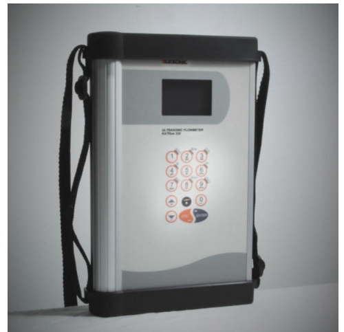
KATflow 230 portable flowmeter.

Volumetric flow rate: m 3 /h, m 3 /min, m 3 /s, l/h, l/min, l/s, USgal/h (US gallons per hour), USgal/min, USgal/s, bbl/d (barrels per day), bbl/h, bbl/min, bbl/s Flow velocity: m/s, ft/s, inch/s Mass flow rate: g/s, t/h, kg/h, kg/min Volume: m 3 , l, gal (US gallons), bbl Mass: g, kg, t Heat flow: W, kW, MW (only with heat quantity measurement option on KATflow 230 and 150) Heat quantity: J, kJ, MJ (only with heat quantity measurement option on KATflow 230 and 150)