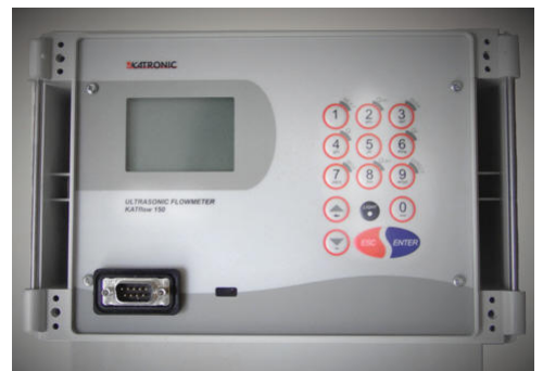
KATflow 150 fixed installation flowmeter.

Katronic Technologies Ltd. 23 Cross Street Leamington Spa CV32 4PX United Kingdom